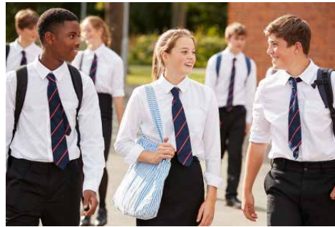
Choosing subjects in Year 8 and 9