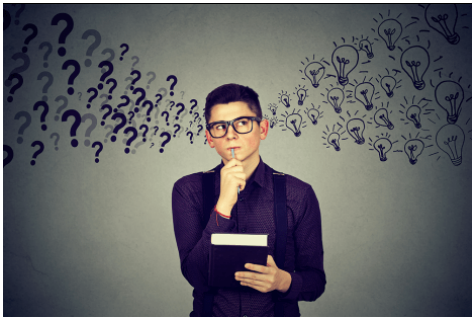
How to choose the right subject or course