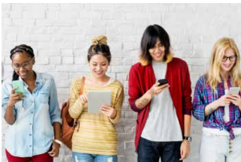
Options at 16