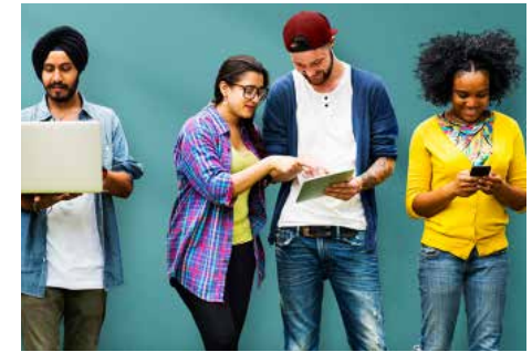
Choosing subjects and courses at 18