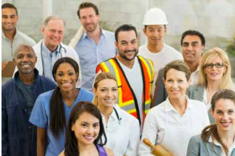
Getting a Job