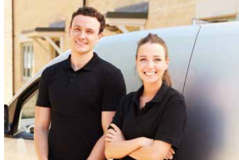
Getting into Self-employment