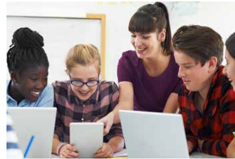
Choosing subjects and courses at 16