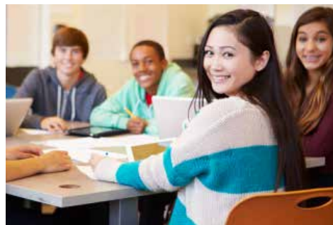
Options at 18